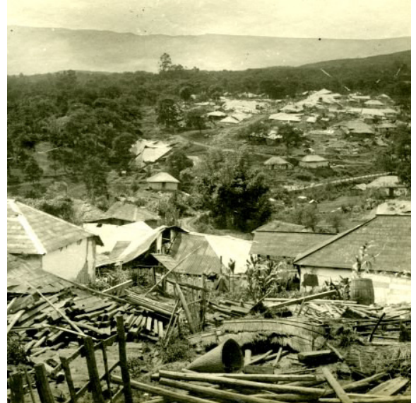
The aftermath of the 1897 Assam Earthquake.

Data from field observations, seismic stations, and GPS show that the area is prone to earthquakes. But it also shows the potential for a